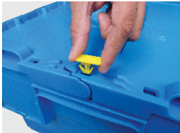
Secure Locking Device