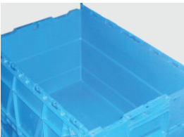
Large Inside Volume