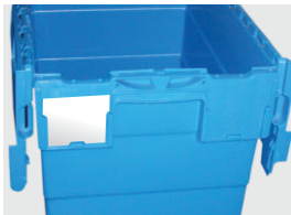
Integrated Card Holders